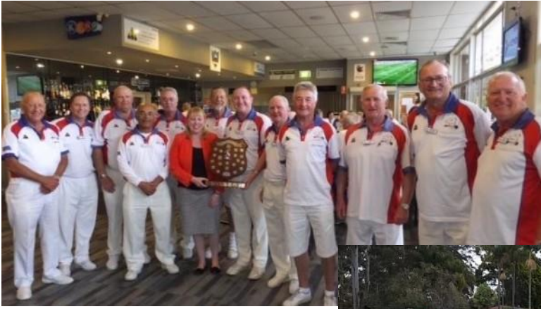
WPH wins the Orange Blossom Festival Shield in September 2015