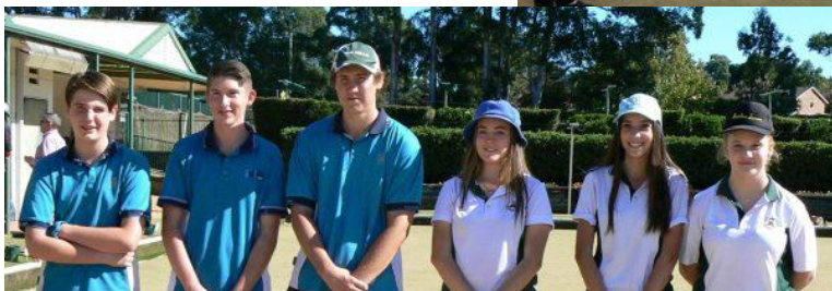
Participants in the CHS Regional Final from Galston High School and Henry Kendall High School