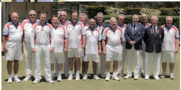
Champions and Runners-up following the 2015 Presentation Day