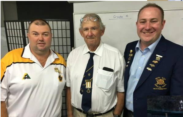
Members and guests enjoying our first Open Day for 2016